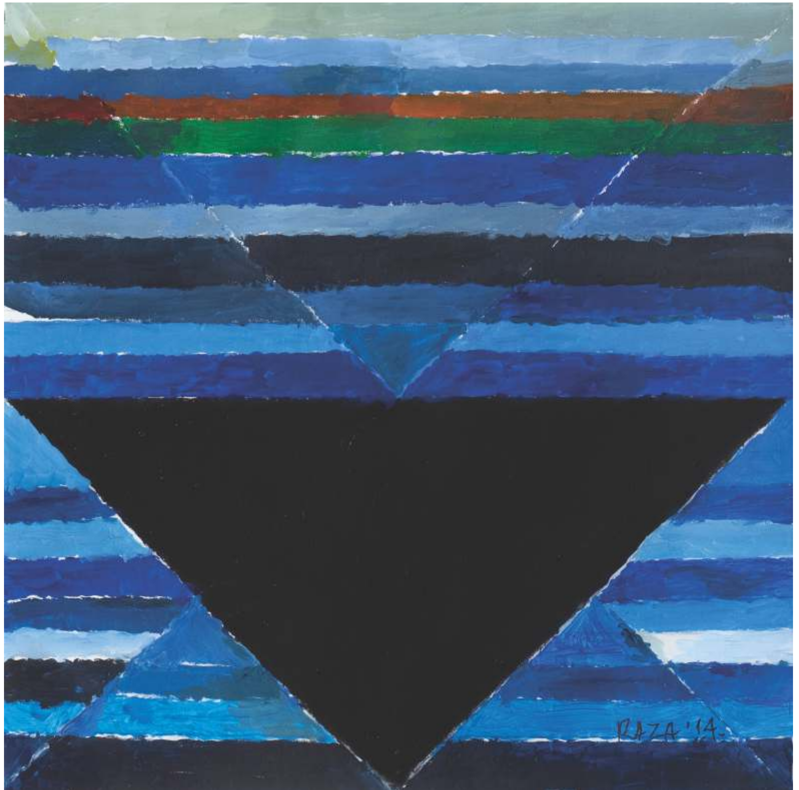
SH Raza Arpan acrylic on canvas, 60 x 60 cms, 2014