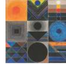
Surya Namaskar, 2004