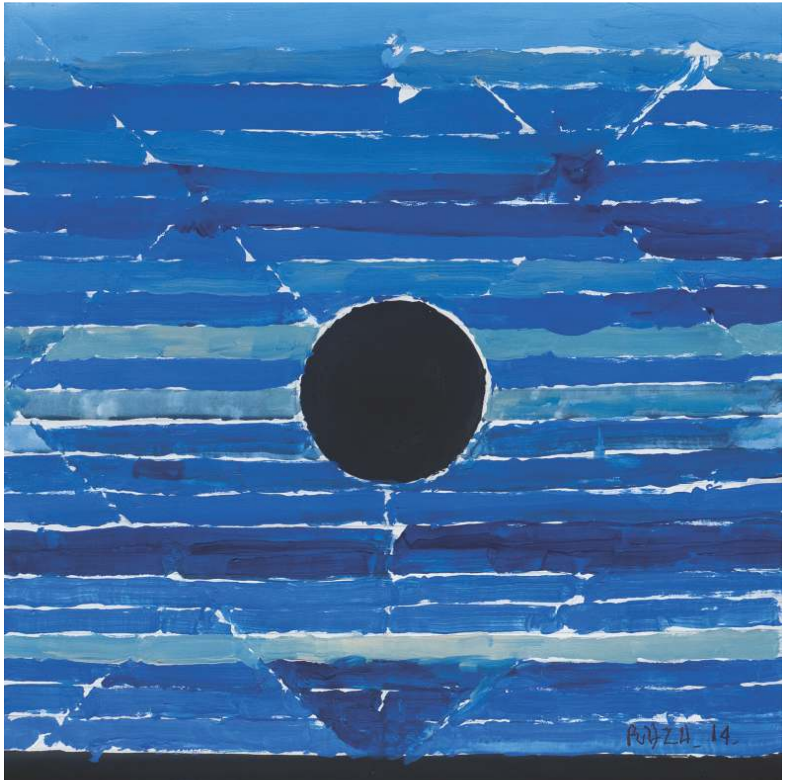
SH Raza Sadaneera acrylic on canvas, 60 x 60 cms, 2014