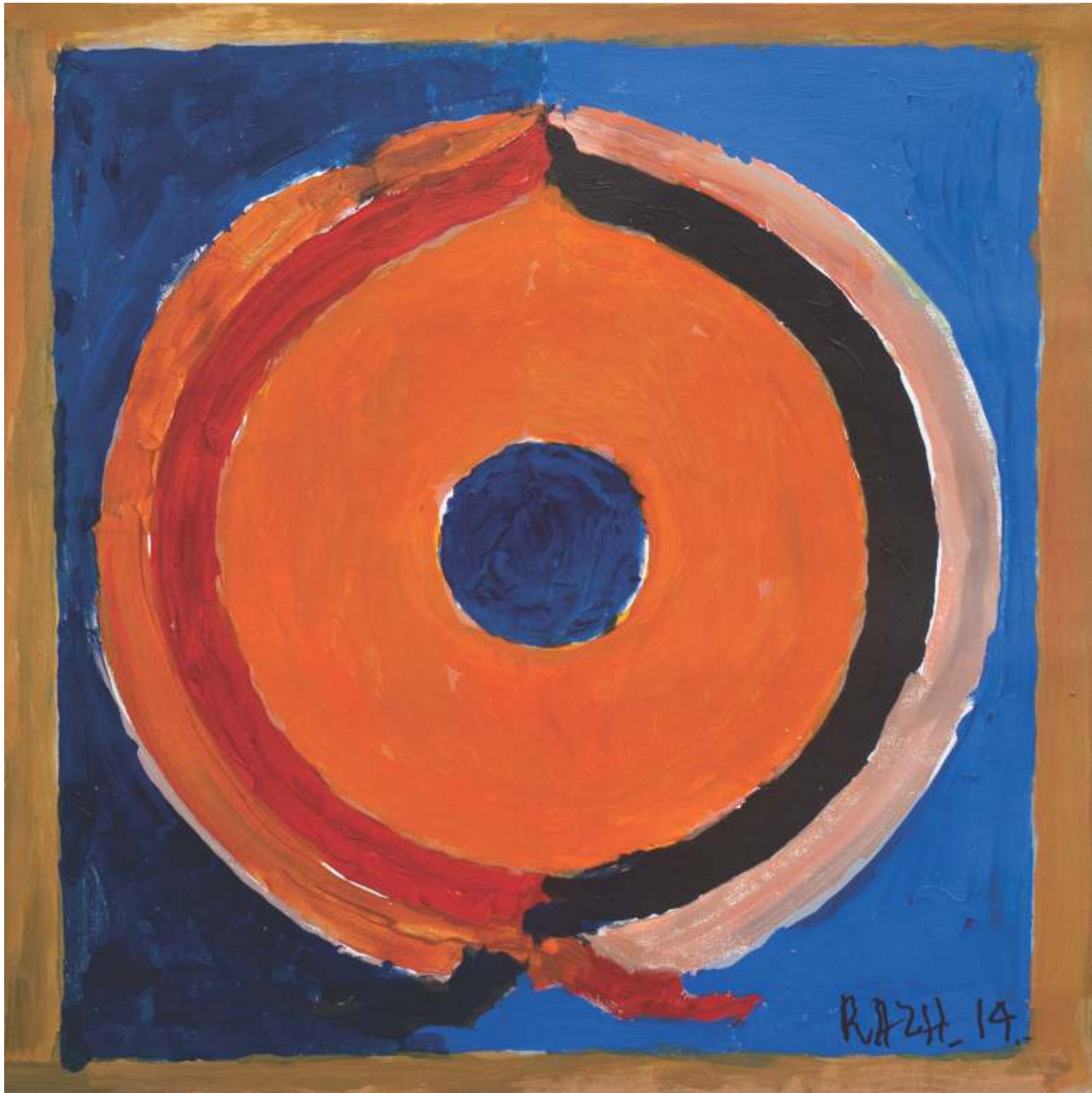
SH Raza Milan acrylic on canvas, 40 x 40 cms, 2014