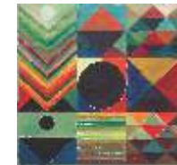
Harit Amav, 2015