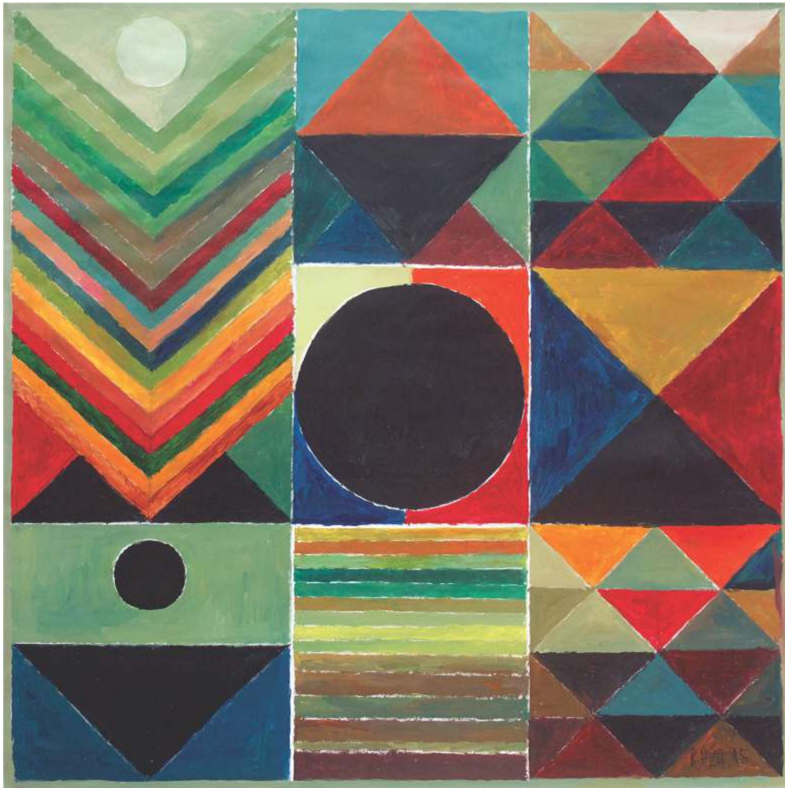
SH Raza Harit - Arnav acrylic on canvas, 100 x 100 cms, 2014