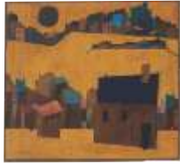
Haut De Cognes, 1951