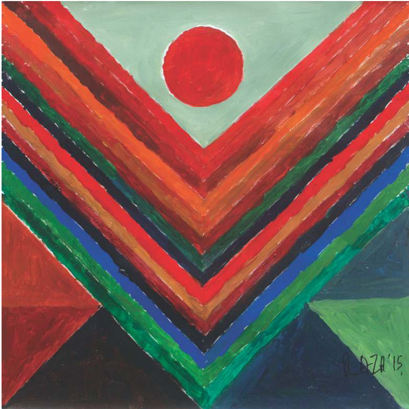
SH Raza Prabhat acrylic on canvas, 50 x 50 cms, 2014