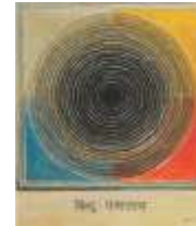
Bindu Panchatatva, 2011