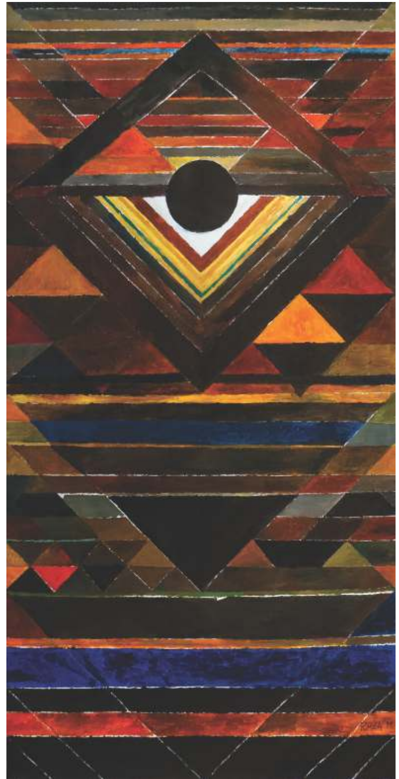
SH Raza Ankuran acrylic on canvas, 200 x 100 cms, 2014