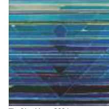
The Blue Moon, 2004