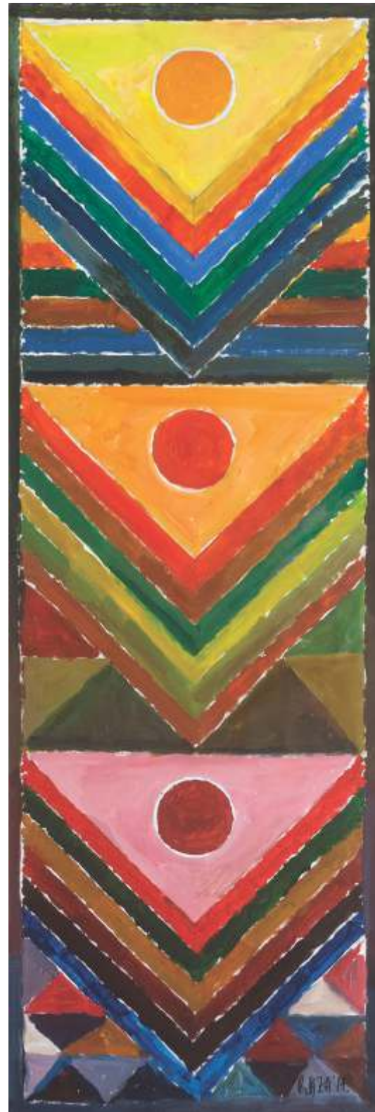
SH Raza Tree of Life acrylic on canvas, 120 x 40 cms, 2014