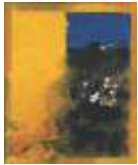
Le Mur Jaune, 1967