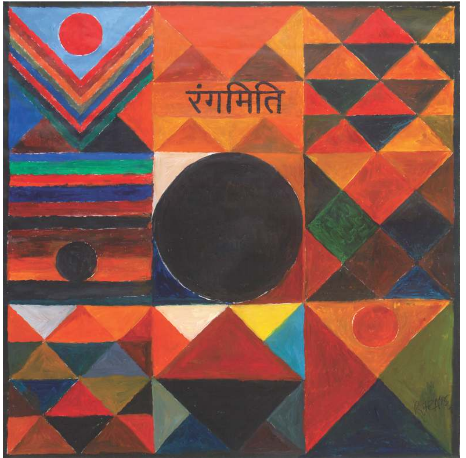
SH Raza Rangmanti acrylic on canvas, 100 x 100 cms, 2014