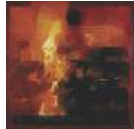
Terre Rouge, 1968