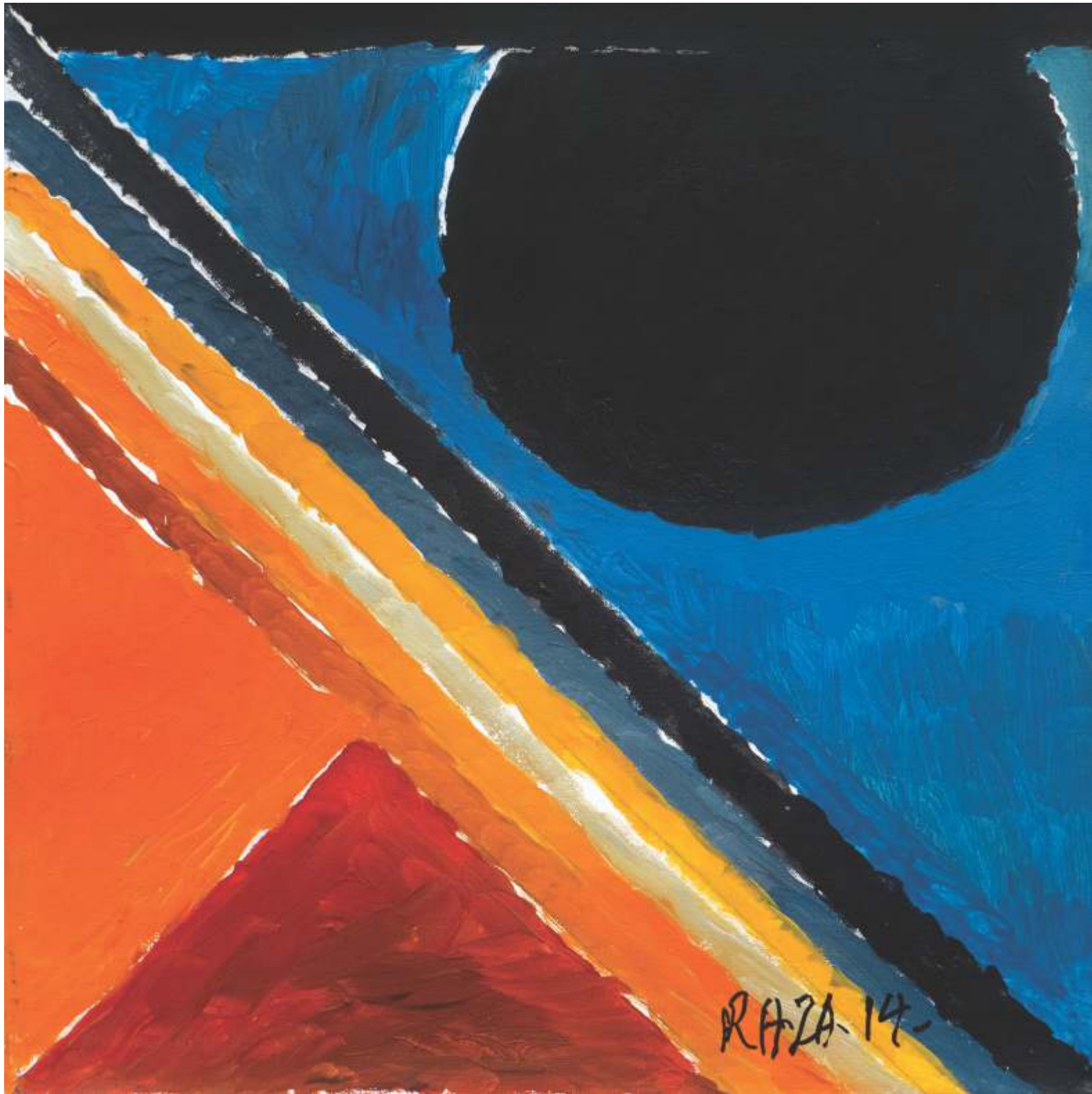
SH Raza Jharokha acrylic on canvas, 30 x 30 cms, 2014