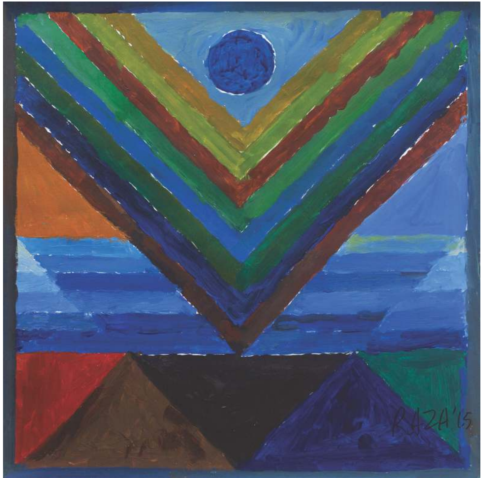
SH Raza Neel Nubb acrylic on canvas, 50 x 50 cms, 2014