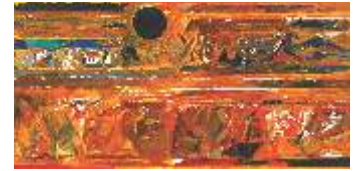
Madhya Desh, 2011