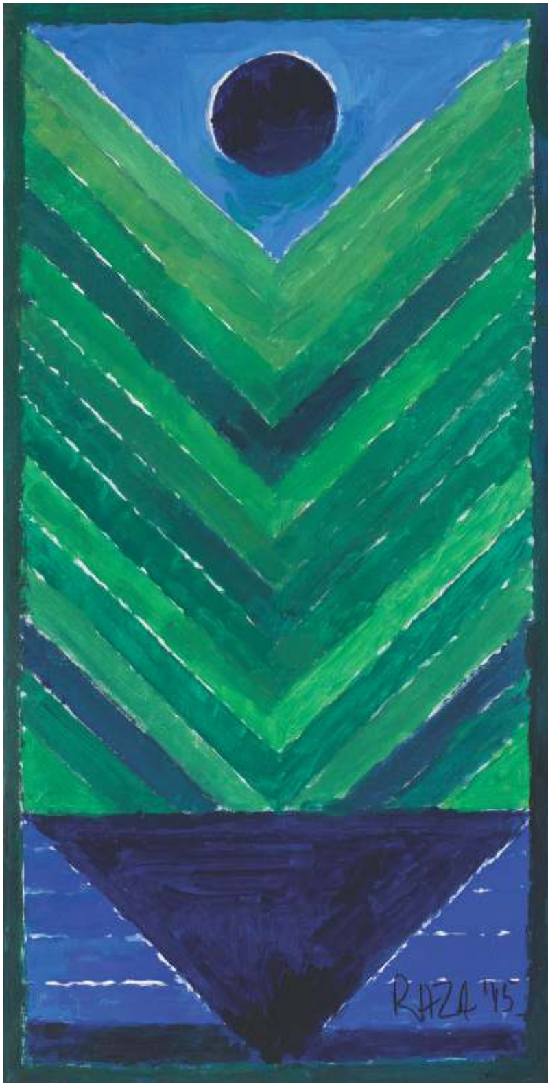
SH Raza Haritaabh acrylic on canvas, 60 x 30 cms, 2014