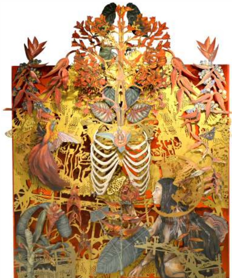
Hymn for the Deathless, Acrylic, wood and mirror, 120" x 96", 2019