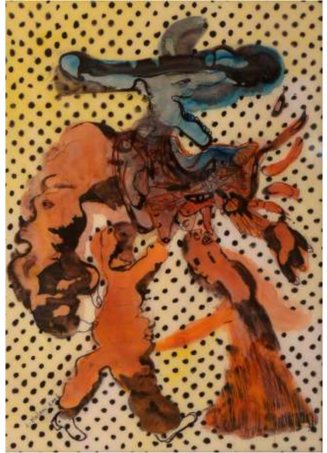
The Dada of Bombay, Acrylic, ink and enamel reverse painting on acrylic sheet, 21.5" x 15.5", 2007