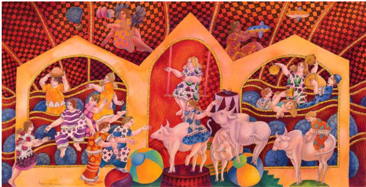
Watercolor Pen & Ink On Paper, 16" x 32", 2016