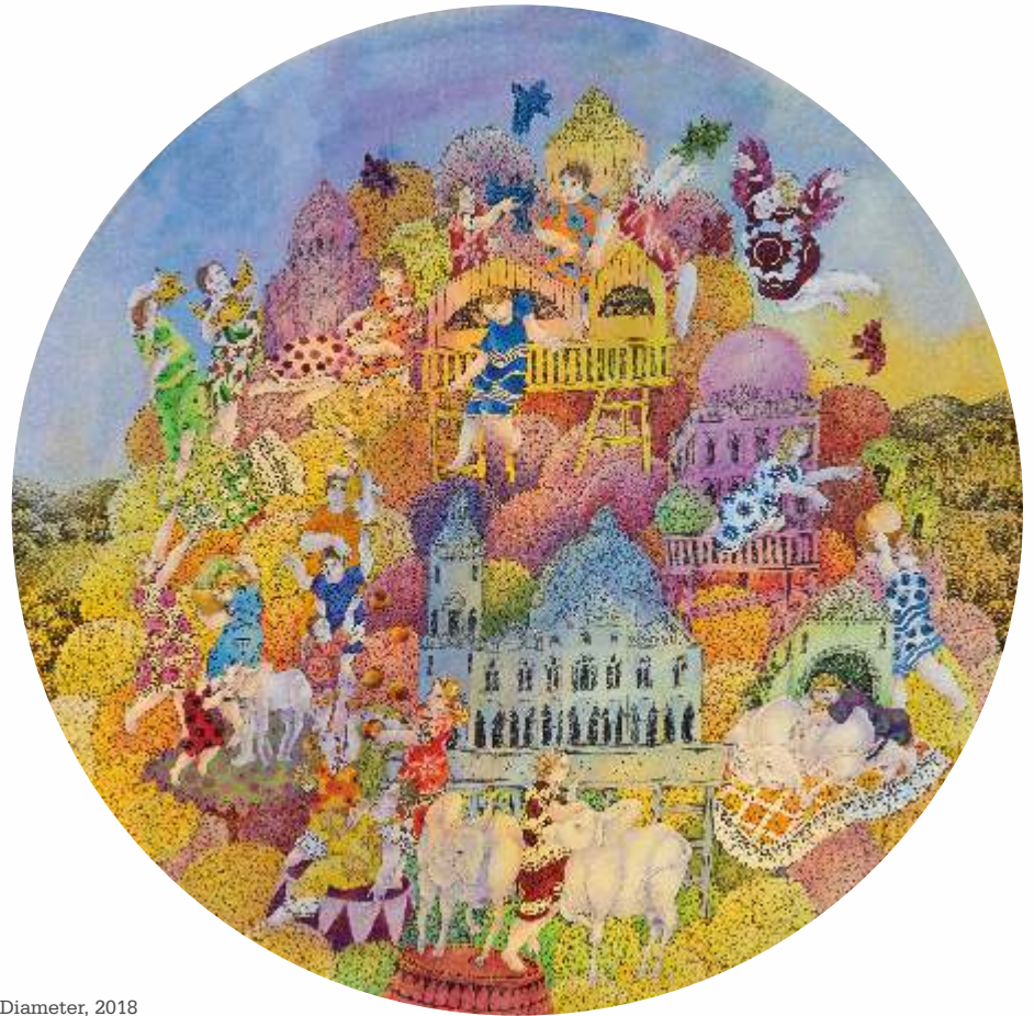
The Sublime Lightness of Being - 6, Watercolor, Pen & Ink on Paper, 32" Diameter, 2018