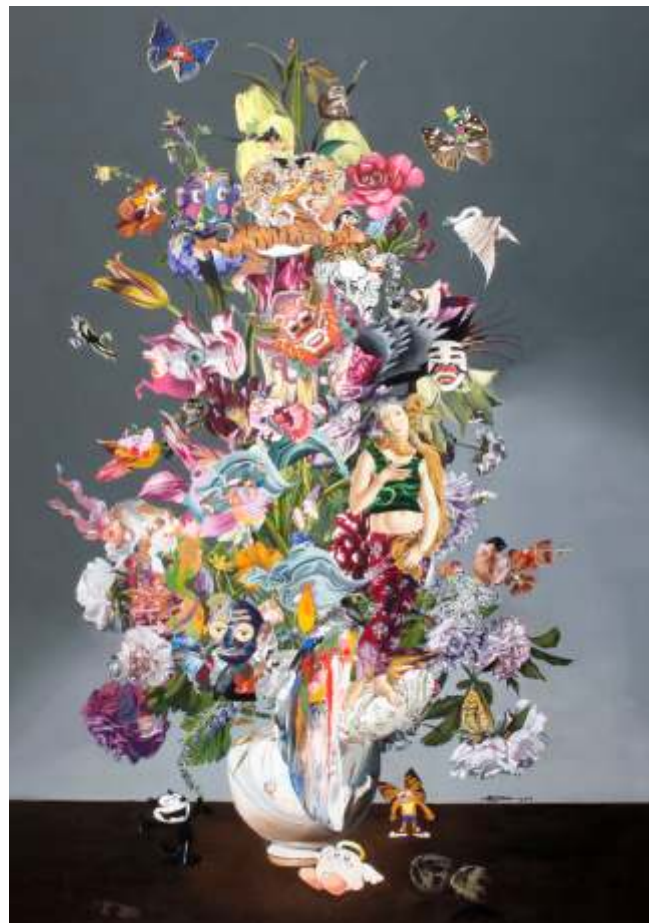
Impossible Bouquet - 2, Acrylic on Canvas, 84" x 60", 2019