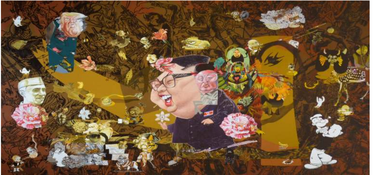
Fake News, Acrylic on Canvas, 72" x 152", 2019