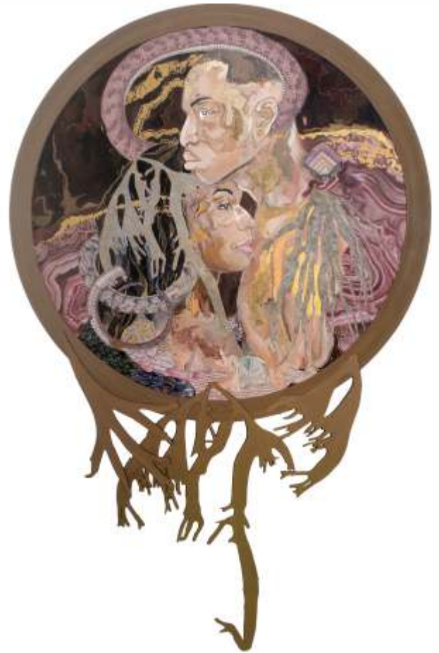
The Lovers, Mixed Media on Canvas 58" x 34", 2019