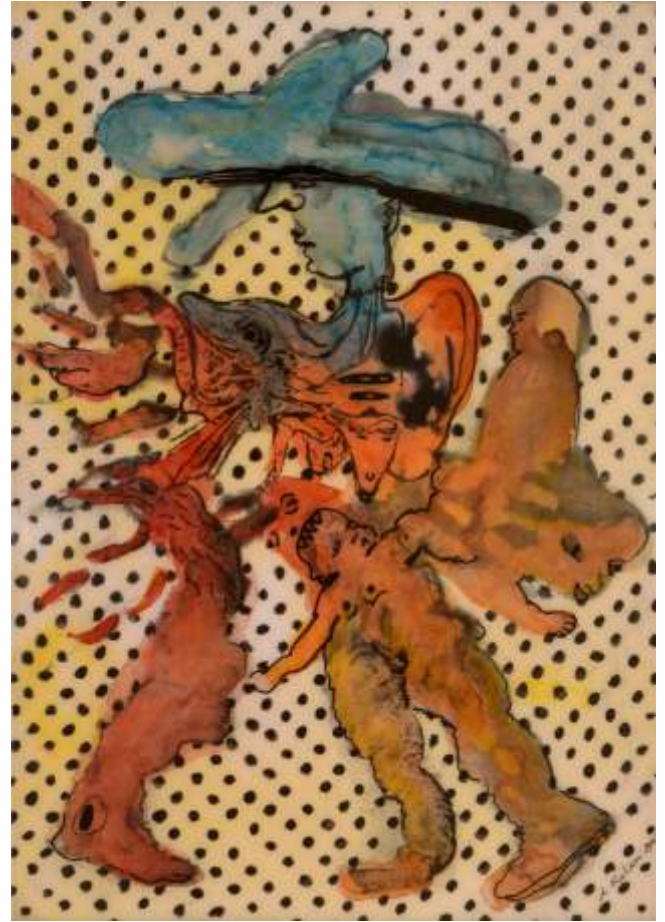
The Dada of Bombay, Acrylic, ink and enamel reverse painting on acrylic sheet, 21.5" x 15.5", 2007