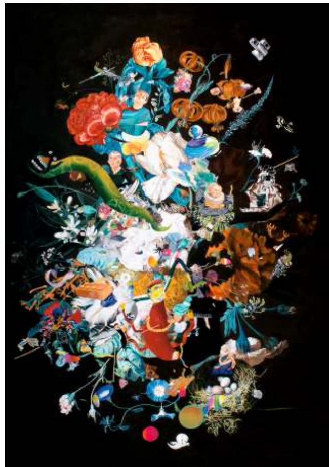
Impossible Bouquet - 3, Acrylic on Canvas, 84" x 60", 2019