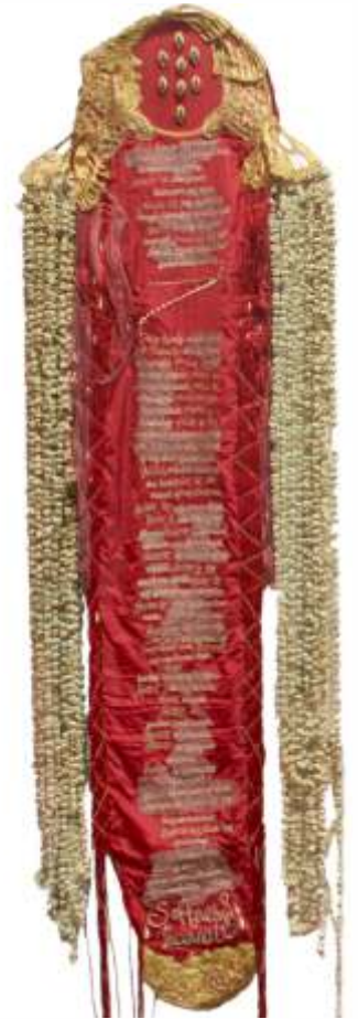
(I am) softness incarnate, Embroidery, 48" x 20", 2019