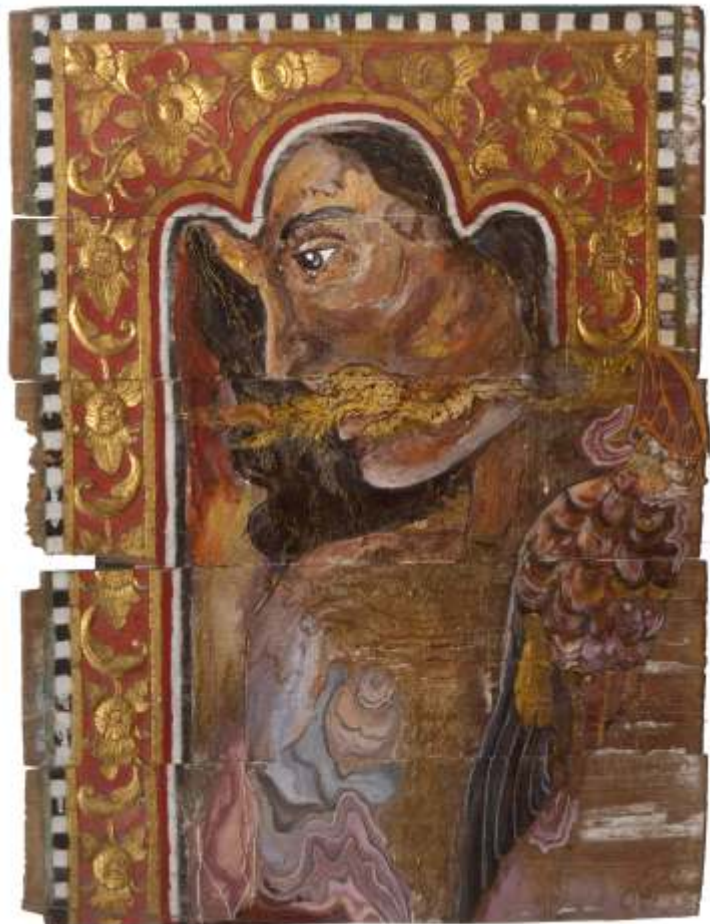
Fire Breathing, Mixed Media on Wood, 33" x 25", 2019