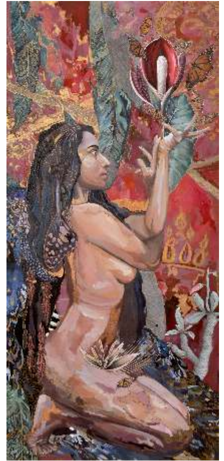
Pollination, Mixed Media on Canvas, 71" x 33", 2019