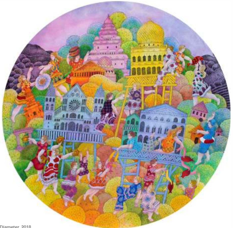
The Sublime Lightness of Being - 3, Watercolor, Pen & Ink on Paper, 32" Diameter, 2018