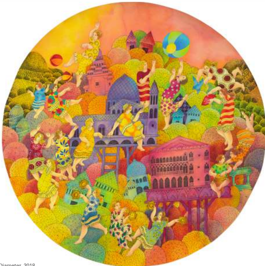
The Sublime Lightness of Being - 5, Watercolor, Pen & Ink on Paper, 32" Diameter, 2018