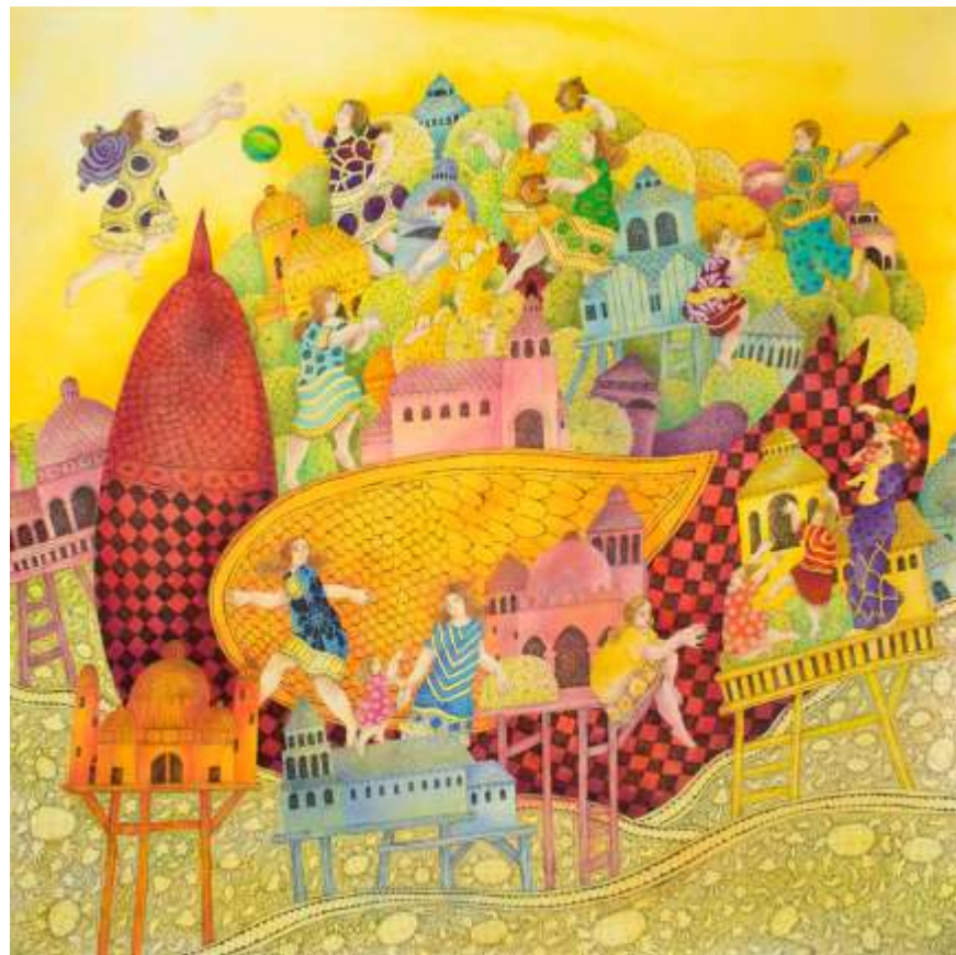
The Sublime Lightness of Being - 2, Watercolor, Pen & Ink on Paper, 32" x 32", 2018